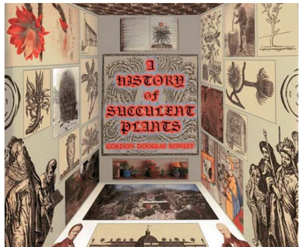
Fig. 3 Book cover. Strawberry Press, 1997

His vast outpouring of material on succulents grew from then on. He must literally have published many hundreds of articles on our beloved plants in numerous newsletters, journals, periodicals and yearbooks around the world.